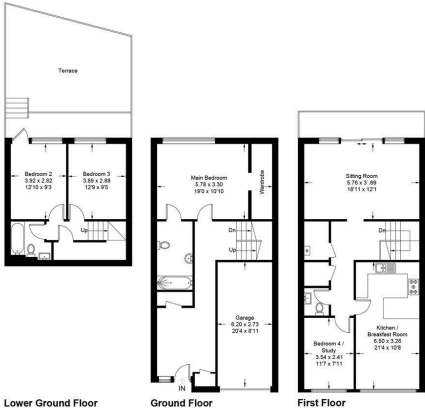
Illustration for identification purposes only, measurements are approximate, not to scale. floorplansUsketch.com © (ID1038252)

Approximate Gross Internal Area = 148.9 sq m / 1603 sq ft (Excluding Garage)